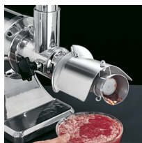
Tomato sauce making